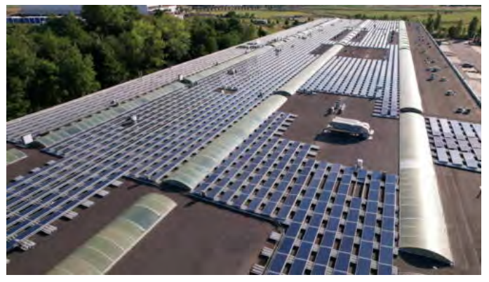
Energy efficient buildings built to \ensuremath{\mathsf{BREEAM}} standards and high \ensuremath{\mathsf{EPC}} ratings

Turn-key, built-to-suit solutions to fit clients' exact requirements