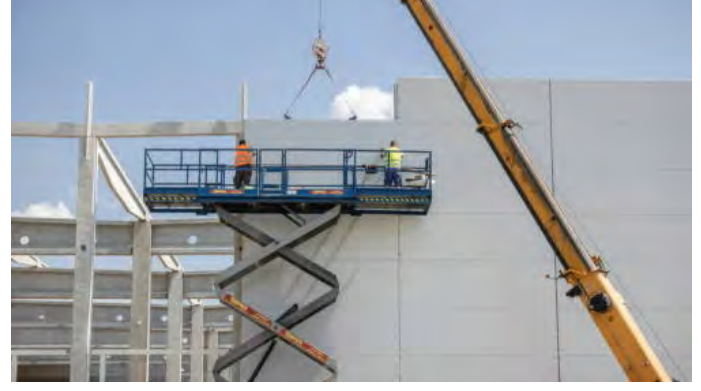
End-to-end development services including permitting, design, construction, project management, and facility management after move-in